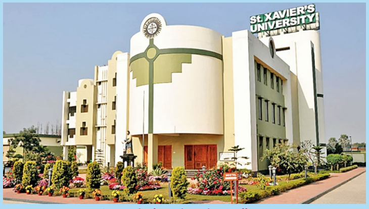
St. Xavier's University, Kolkata

People in general, particularly educationists, are perturbed at the hurry-burry manner in which the policy was announced during the pandemic period while all educational institutions remained closed. Was it an easy way out 'to fish in troubled water' that too without any discussion in the Parliament?