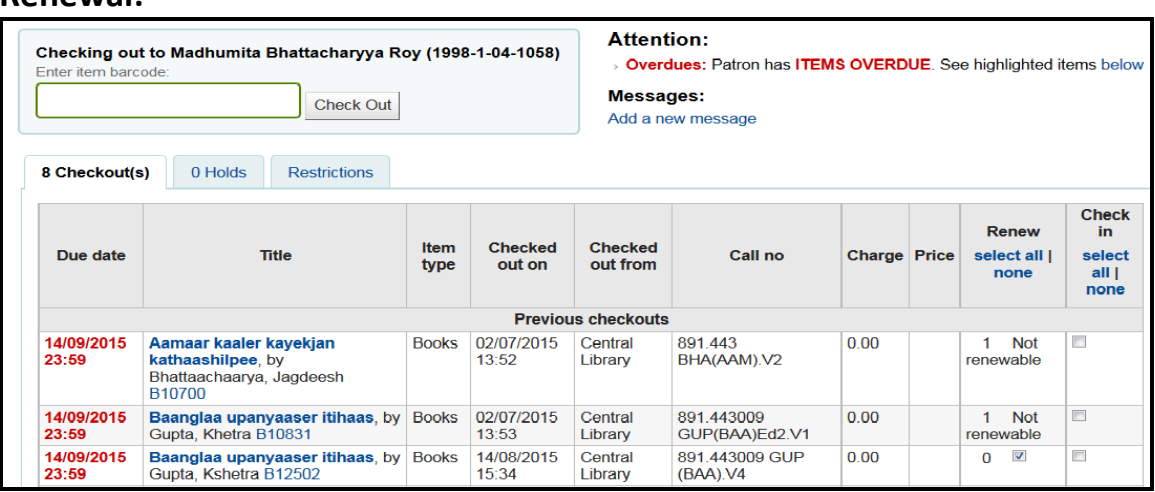
Figure 3 – Renewal Screen in Koha

Renewal of items from the patron account is a more user-friendly option. In Koha, renewal status and renewal options appear beside checked out items in the patron account area (assuming that online renewal is turned on). Renewal status is accompanied by any necessary explanation, for example: 'Not renewable (on-hold)'. Simply, enter the barcode/accession number of the document and it will be renewed to