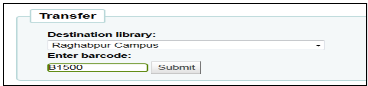
Figure 5 – Branch Transfer Screen in Koha

From time to time the library may want to send a group of items from one branch to another. When this is done, the catalogue must be updated to reflect the new location