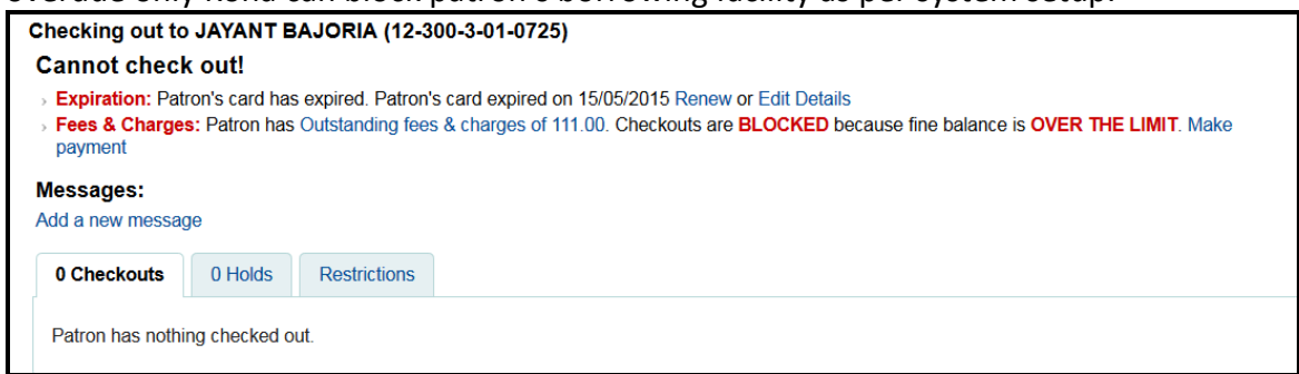
Figure 4 – Automatic Card Block Screen in Koha

LibSys and Koha both allow automatic card block due to books overdue but for fine overdue only Koha can block patron's borrowing facility as per system setup.